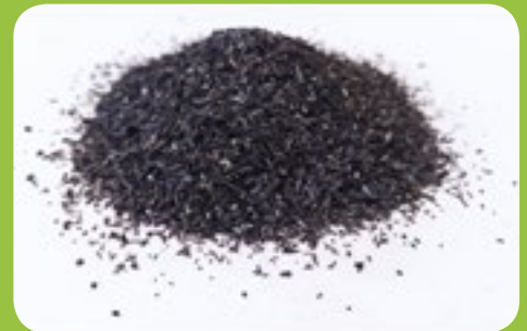
Figure 2. Biochar